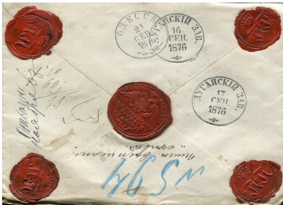
Figure 1. Front and back of money letter with “Луганскій Зав.” circular date-stamp.

post office. The amount of money sent - 60 rubles - is indicated on the front side of the envelope. The letter is addressed to the merchant Grigory Mikhailovich Butovich in Odessa, for subsequent redirection to a monastery on Mount Athos for the attention of the Abbot Archimandrite (Superior) Andrew and other brothers.