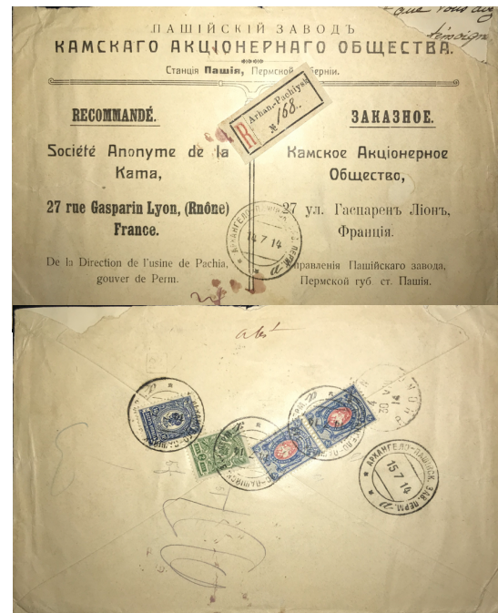
Figure 2. Front and back of Registered letter with with “Архангело-Пашійск. Зав.” cds.

Lyon at Gasparin Street 27. Registration is clearly indicated on the front of the envelope – in French on the left and in Russian on the right - as well as by the label with the red “R” and the registration number 168. The inscription “Архангело-Пашійский Заводъ Пермской” (abbreviated “Архангело-Пашійск Зав. Перм” or, in English “Arkhangel-Pashiysk Factory in Perm”, is visible on cds on both the front and back of the cover. The letter is franked on the back with 4 stamps totaling 40 kopecks (14*2+10+2), which was the postage rate